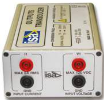
Output transducer module

The items can be ordered separately: the Output transducer alone, or also one cable or both.