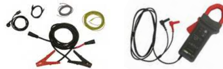
Testing cables and current clamp

Ranges: 40 A DC (10 mV/A) and 400 A DC (1 mV/A). Accuracy: 1.5% up to 40 A; 2% up to 400 A. Maximum conductor diameter: 30 mm.