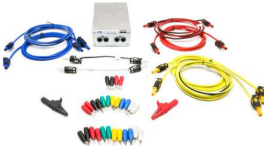
Voltage Module Accessories