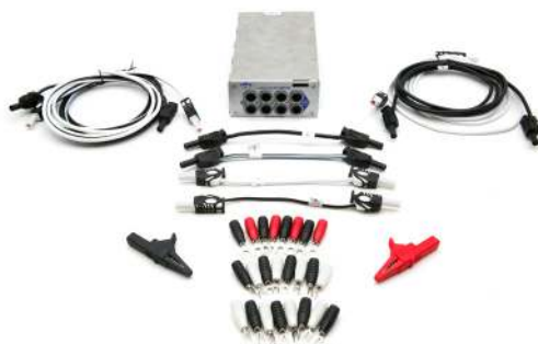
Logic I/O Module Accessories