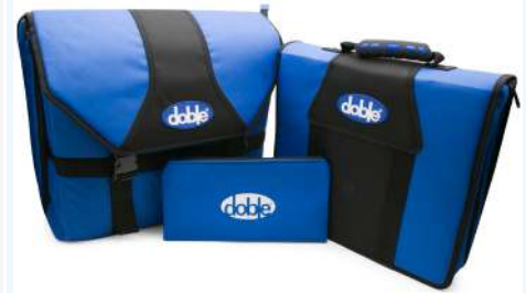
Instrument and Accessory Bags