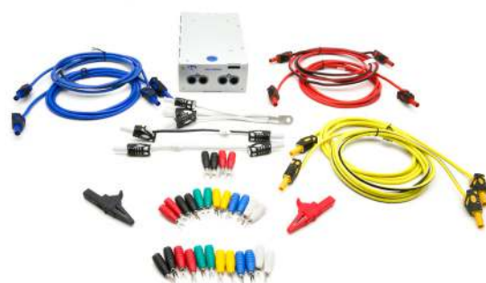
Current Module Accessories